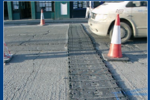
A typical road crossing

Available to hire from GT Trax Ltd Tel: 01763 252854 www.trenchlink.net