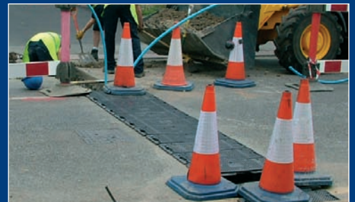
Trenchlink on site